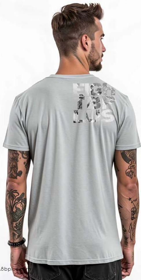
EIGHTBPLUS TEE GRAY MELANGE