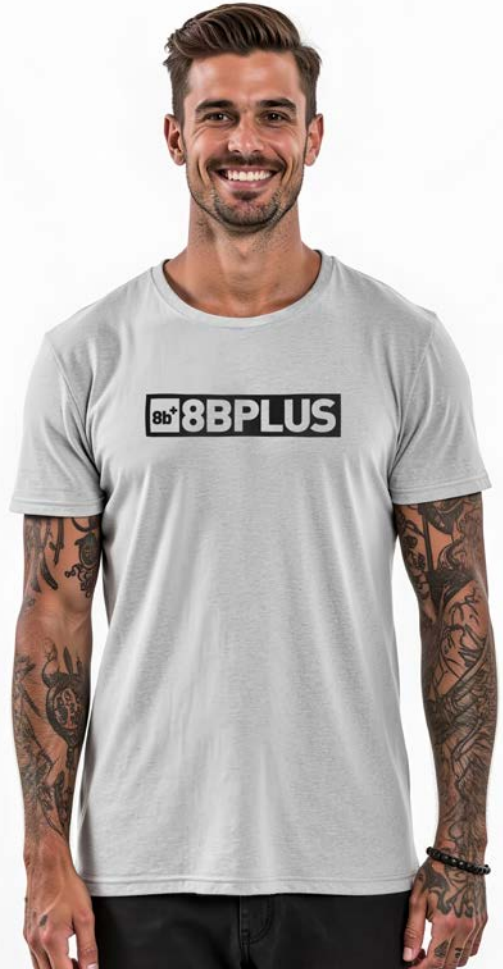
BRAND TEE GRAY MELANGE