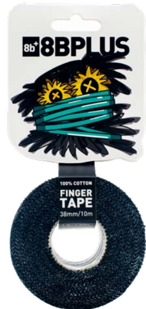
FINGER TAPES HANGER PACKAGING