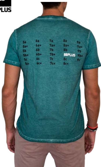
GRADER TEE WASHED OUT GREEN