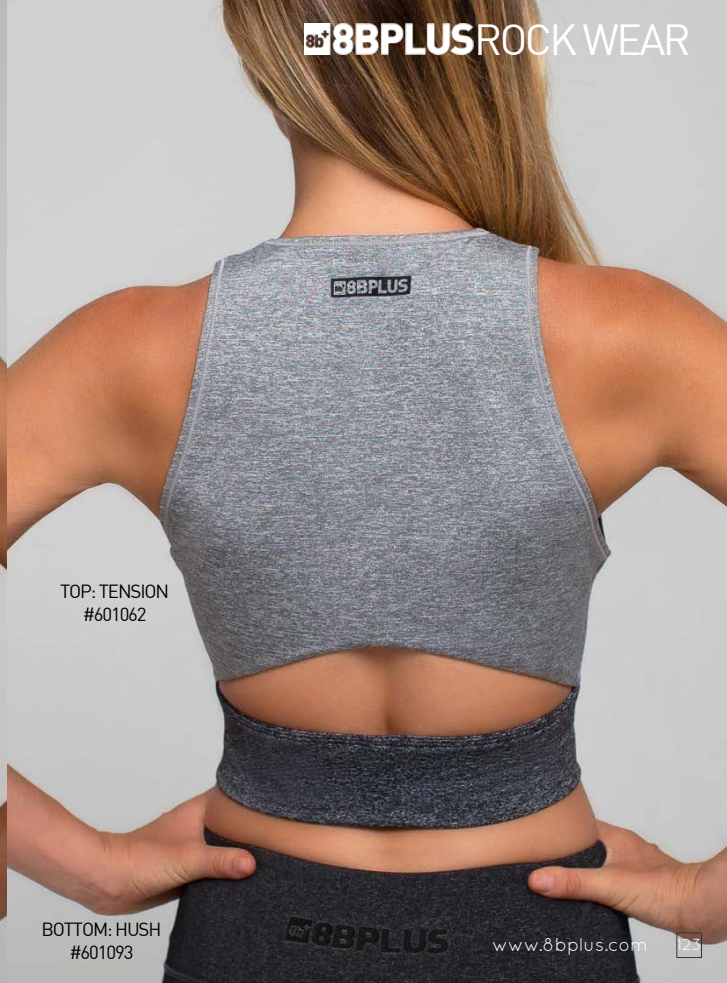
TOP: TENSION #601062