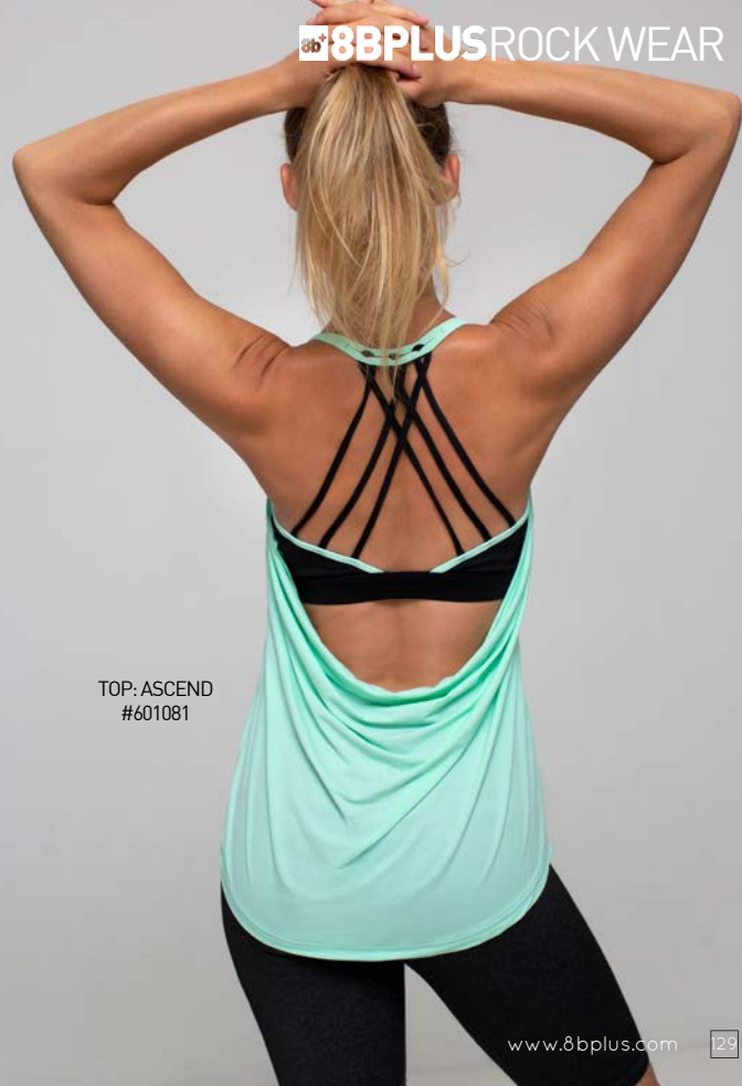
TOP: ASCEND #601081