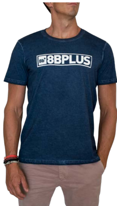
BRAND TEE WASHED OUT BLUE