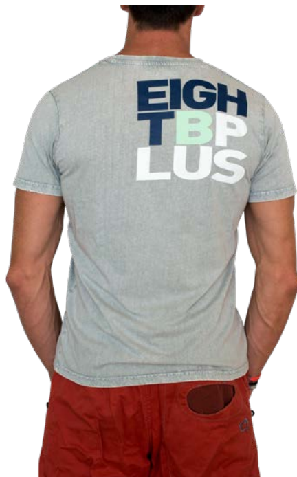
EIGHTBPLUS TEE WASHED OUT GRAY