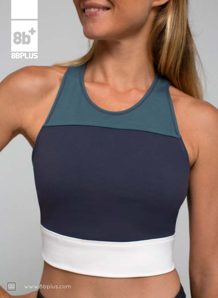
TOP: TENSION #601061